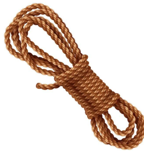
*Sample cord TCL will provide

Your TCL television includes hardware to securely tether your television to your wall to safely prevent the risk of falling. Please contact TCL with the model number of your TV, and distance that your TV will be from the wall. We will send you the required cord cut to the correct length.