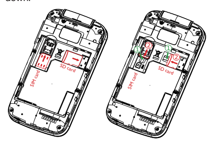
Step 3. To insert SIM card or microSD card, push the SIM card or microSD card into the card slot with the gold-colored contacts facing down

To remove the SIM card or microSD card, press down on the small plastic tab (0), then slide out the card (2). Do not use force or any sharp objects.