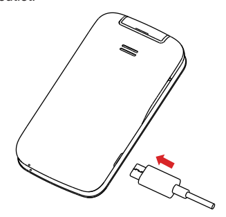
Step 6. Charge your phone fully before turning it on and starting the set up process. Insert the small end of the charging cable into the charger port on the phone. Insert the other end of the cable into your wall charger and plug it into a wall outlet.

WARNING: Only use the charger and cable supplied with the phone. Using incompatible chargers or tampering with the charging port could damage your phone and void the warranty.